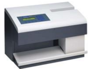
TLD Reader RE-2000