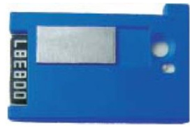
TLD card type RADOS with 0,5mm Al-filter