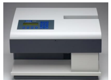
Rados RE-2000 TLD Reader, universal and precise

All information in this brochure is subject to technical changes without notice.