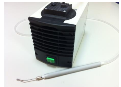
Vacuum Tweezers incl. Vacuum Pump (115-230V, 50-60Hz)