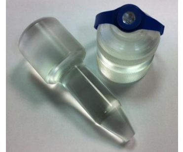
Tool for assembling and disassembling