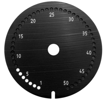
Carrier disc for TLD chips and TLD discs