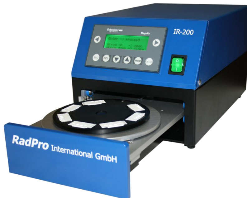
Table Top Irradiator IR-200