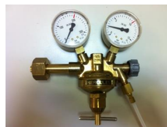
N2 gas pressure reducer, metric