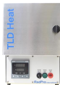
Programmable TLD Oven