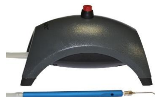
Vacuum Tweezers incl. Vacuum Pump