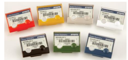
TLD card holder type Genesis

All information in this brochure is subject to technical changes without notice.