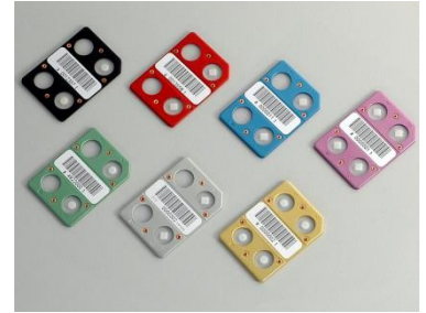
Aluminium TLD cards