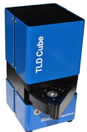
TLD reader TLDCube